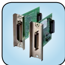
Plug-In Interface Modules